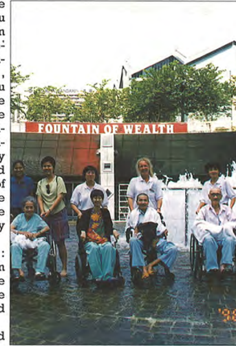
Residents and volunteers from the Dover Park Hospice enjoying a moment's respite at the Fountain of Wealth on 6 Aug 98.

A visit to Suntec City and "Fountain of Wealth" is a "MUST" for all visitors to Singapore . This is liken to visiting the Great Wall if you are visiting Beijing.